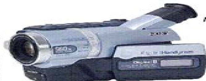
Photo : DCR-TRV140E