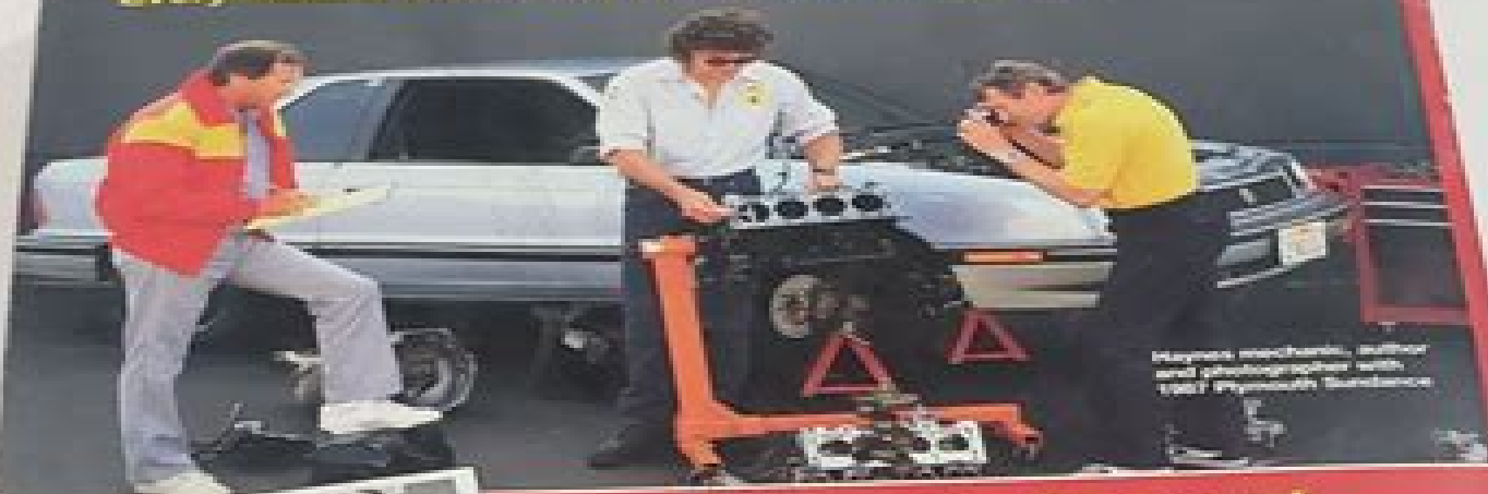
Haynes mechanics, author and photographer with 1987 Plymouth Sundance

Every manual based on a complete teardown and rebuild!