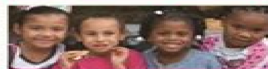
Experiencing Girl Scout Traditions