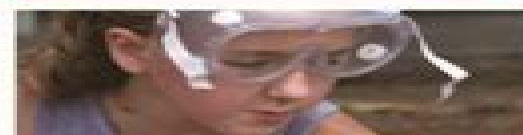
Exploring Science, Technology, Engineering, & Math