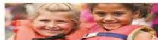
Developing Lifelong Friends

Girl Scouts of the Commonwealth of Virginia Offers Programming to Girls in K-12th Grade.