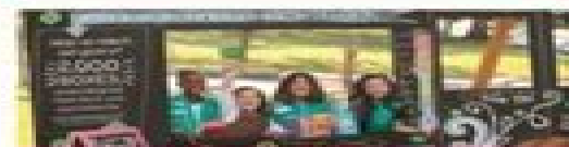
Learning Financial Literacy Skills

Girl Scouting builds girls of courage, confidence, and character, who make the world a better place.