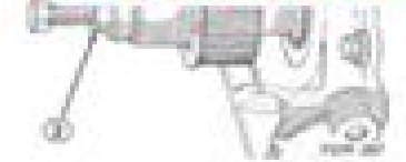
Fig. 8 Piston Markings