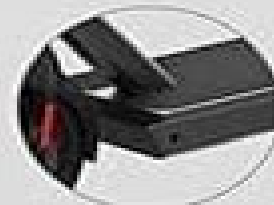
8" Bluetooth Speaker + Extra Wide LED Deck