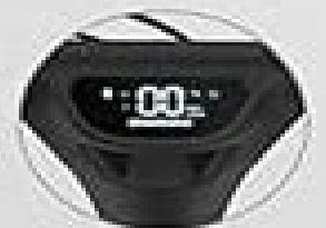
3 Speed Modes