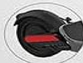
Dual Rear Arm Suspension