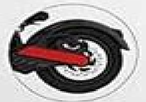
High Performance Rear Disc Brakes