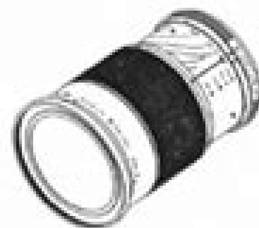
KIRON AUTOMATIC FIXED MOUNT LENS 28-105MM F3.2-4.5 PENTAX-K MOUNT

Parts 10, 11, 30, 31 and 36 are not included in K68. Part 270 is included in K68 only (not in K63).