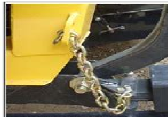
Loose Restrainer Chain