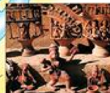
The Crafts Museum

an impressive fort-palace built by Shah Jahan, was the seat of Mughal power. After the Indian Mutiny of 1857, the British converted it into a garrison and it was stripped of many precious treasures.