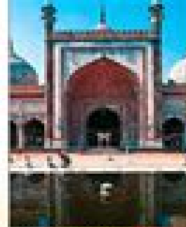
The Jama Masjid

SITUATED ALONG THE YAMUNA RIVER, New Delhi was built by the British in the 1930s and is the youngest of several historic cities that have occupied this site. Now a noisy and chaotic metropolis of 14 million people and a mélange of shanty settlements and smart colonies, it is still dotted with the remains of its interesting past. There are museums and art galleries with impressive collections, and its shops offer a tempting array of handicrafts. Delhi is a major cultural centre of the country with music, dance and art events held throughout the year.