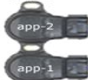
accelerator pedal position sensors