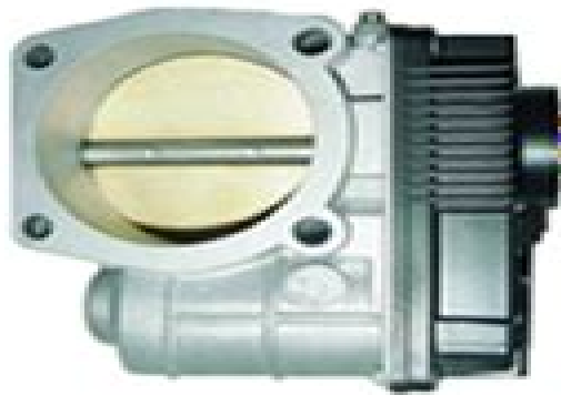
electronic throttle body