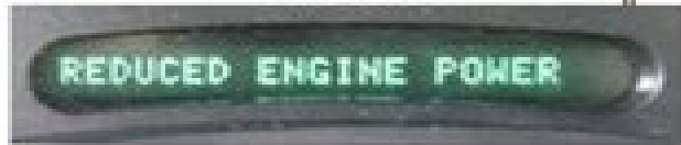
instrument panel cluster