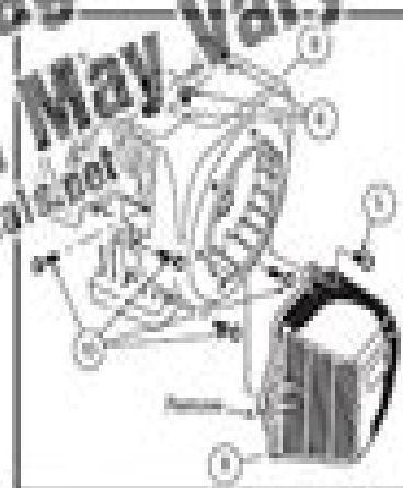
Figure 14-25 Fan Housing Removal