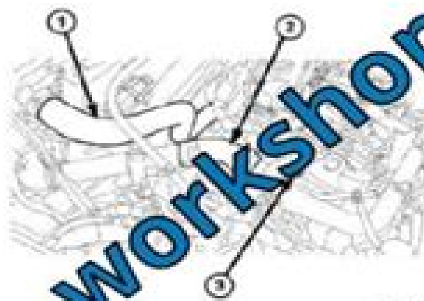
Fig. 8: Charge Air Cooler Hoses

9. Disconnect the engine harness connectors (1) and (2) from the