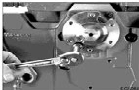
Figure 369 Remove fan drive hub

NOTE: Engines may be equipped with optional air compressor or both.