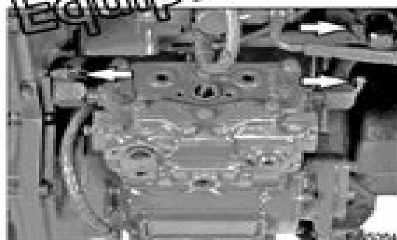
Figure 370 Loosen coolant hose clamps

11. Loosen two coolant hose clamps. Remove coolant hoses to air compressor and remove air compressor from crankcase.