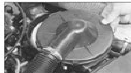
20.2b . . . then lift off the lid . . .