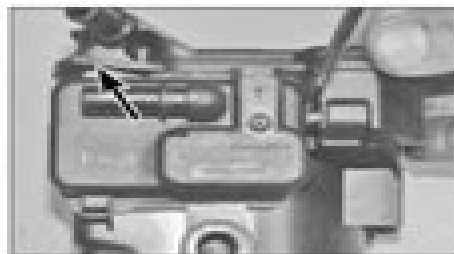
19.53a Release the clip (arrowed) . . .