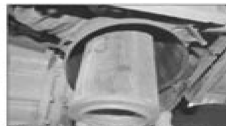
20.10 Withdraw the filter element from the housing – early DW series engines