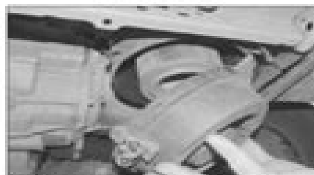
20.9 Release the retaining clips, and remove the cover from the base of the air cleaner filter housing – early DW series engines