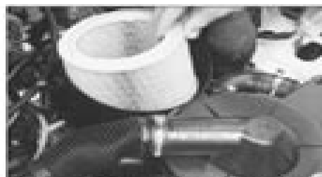
20.3 . . . and withdraw the filter element – XUD series engines