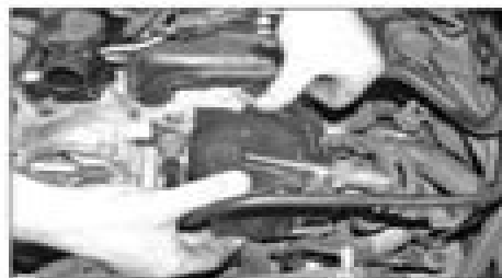
19.52 Release the retaining clip and remove the fuel filter