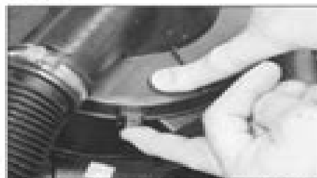
20.2a Release the clips securing the filter housing lid . . .

7 Proceed as described above for XUD series engines.