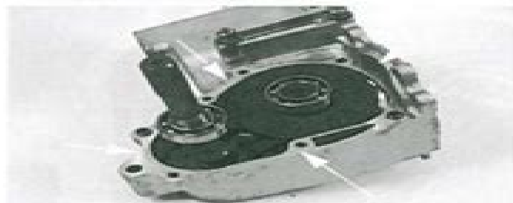
Apply Crankcase Sealant to mating surfaces.