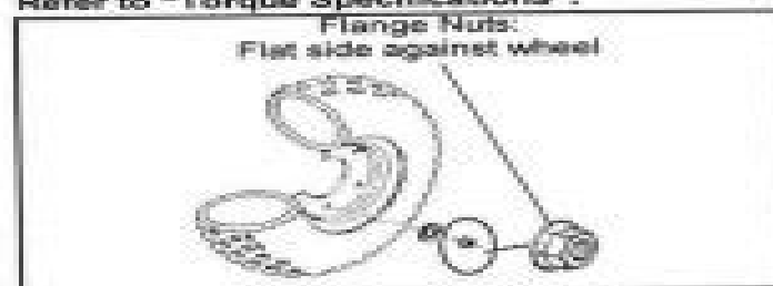
Front Hub/Wheel Exploded View