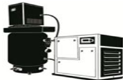
Fully packaged unit with air dryer (vertical tank)