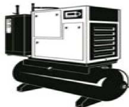
Fully packaged unit with air dryer (horizontal tank)