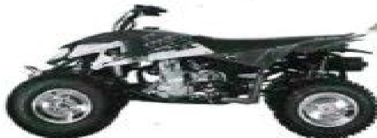
OUTLAW 525 IRS