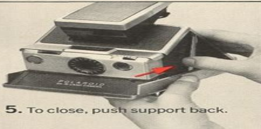
5. To close, push support back.