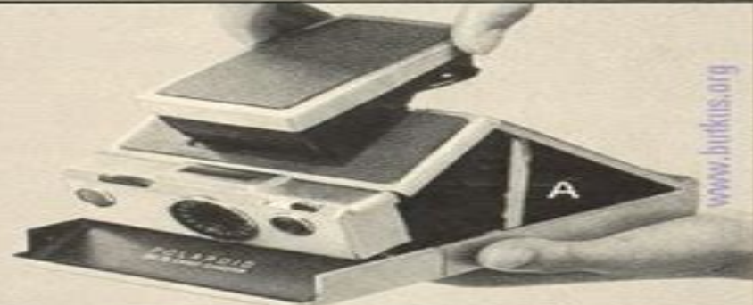
4. ...until cover-support (A) locks.