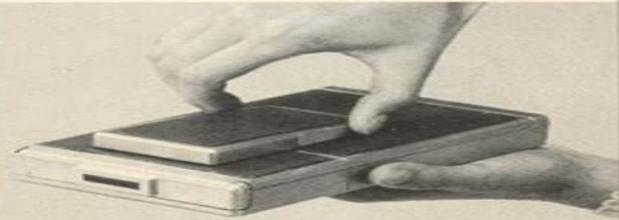
2. Lift small end of viewfinder cap.