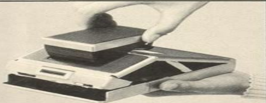
3. Pull straight up...