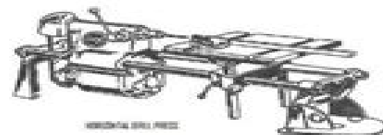
HORIZONTAL DRILL PRESS