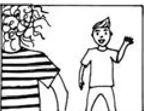
Over The Shoulder