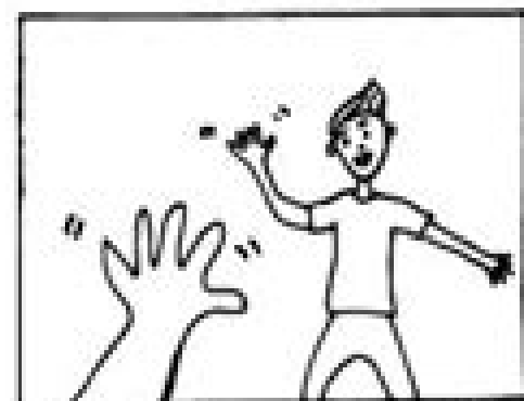
Point of View Shot (POV)