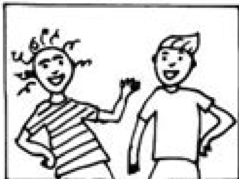
Mid Shot (or Two Shot)