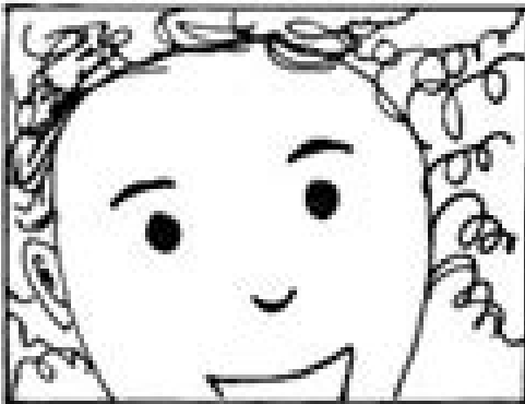
Extreme Close Up