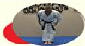
Bow when entering or exiting the dojo.