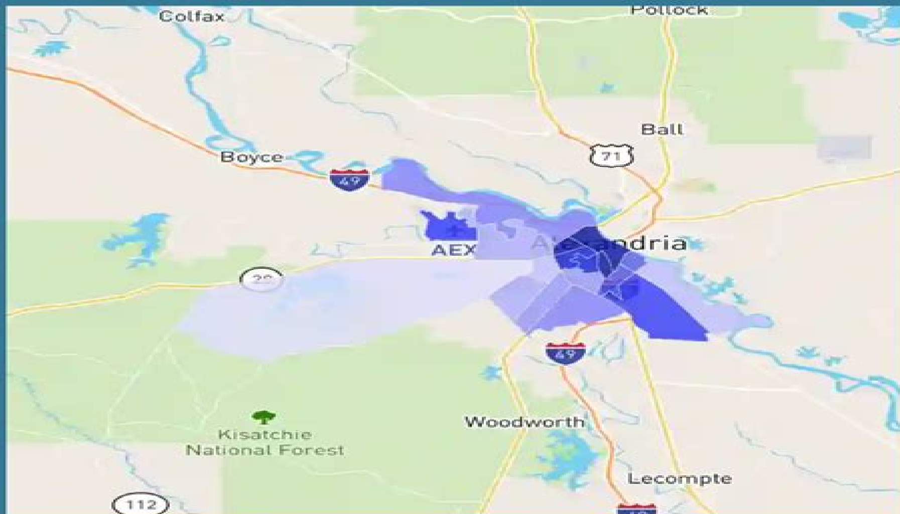
Alexandria, LA Crime Map By Neighborhood