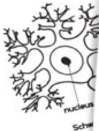
Nervous System 1a