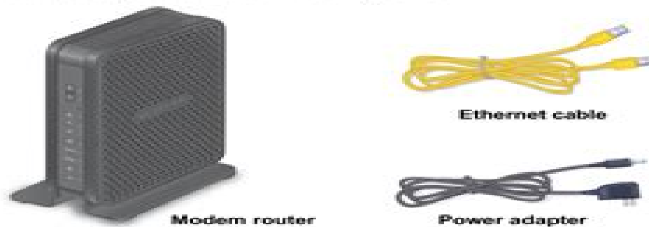
Figure 1. Package contents

Your package contains the following items.