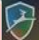
iMacBook Air (S... 8.5.1 (1214))