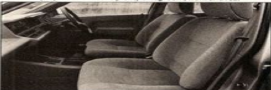
Oddment accommodation is good and seats softly padded