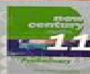
New Century Maths 11 General Workbook Preliminary ISBN 978 0 17 033007 8