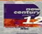
New Century Maths 12 General Workbook HSC ISBN 978 0 17 033008 5