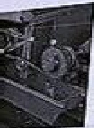
FIGURE 27 REAR ROLLER ASSEMBLY

Roller adjustment is shown in Figure 27. To adjust the roller, turn the roller screw clockwise to raise the roller and counter-clockwise to lower the roller. The roller should be adjusted so that the roller is in contact with the ground. The roller should be adjusted so that the roller is in contact with the ground.