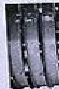
FIGURE 30 WICK UP OVERHAULING CLAMPS