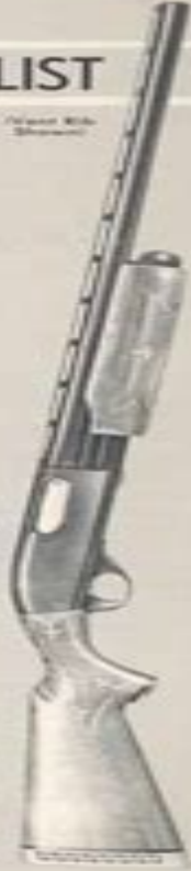
(View Side Shown)