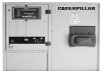
Common Design EMCP II