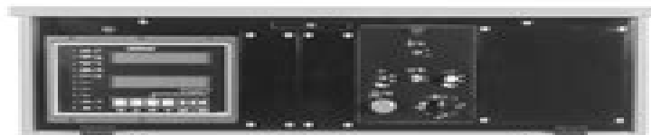
EMCP II and EMCP II+