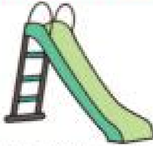
Inclined Plane - Slide