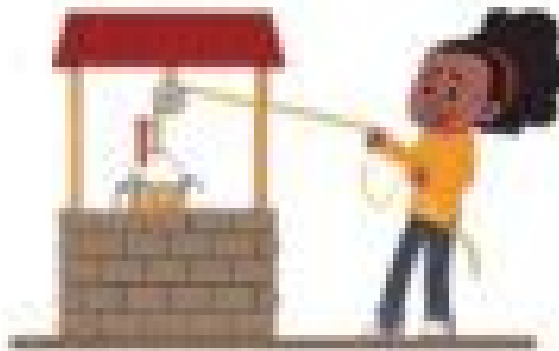
Pulley - Water Well