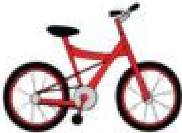
Wheel and Axle - Bicycle