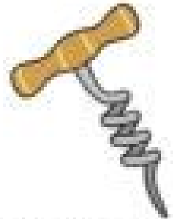
Screw - Corkscrew