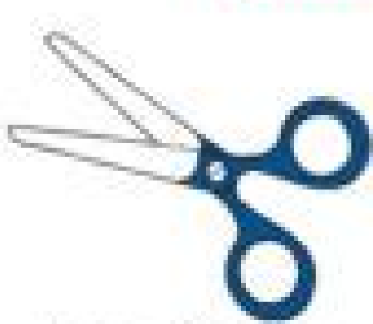
Lever - Scissors