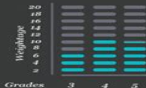
Number and Operations in Base 10 (NBT)