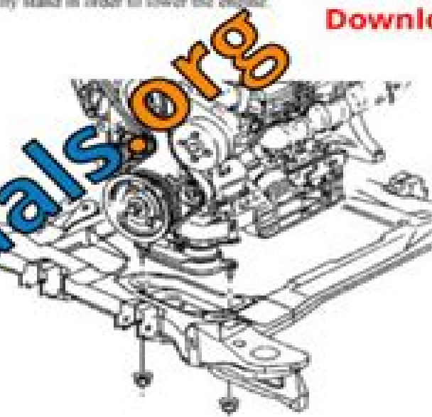
Fig. 31: Identifying Engine Mount Lower Nuts