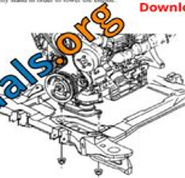
Fig. 31: Identifying Engine Mount Lower Nuts * Courtesy of GENERAL MOTORS CORP.

Install the existing in-board bowyer seats.