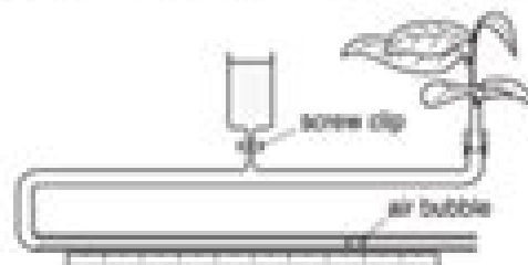
Why it is an issue (H&W)

A number of questions will ask you to calculate the volume of water lost over a period of time/ the rate of water loss. To convert the distance moved by the _____ to volume you need to use the equation _____. This will give the _____ of a cylinder and therefore the volume of water that has moved into the plant. To measure the rate of _____, the volume of water taken in by the plant should be divided by the time taken for this to occur. This is usually given in the units _____ (centimetres cubed per minute).