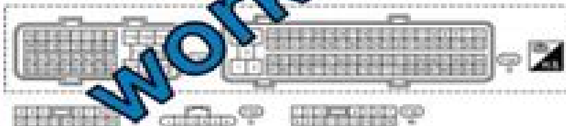
DTC P0122, P0123 TP SENSOR