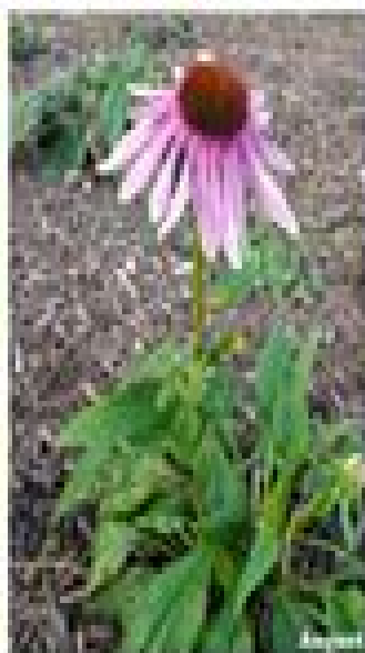
Purple Coneflower Echinacea purpurea