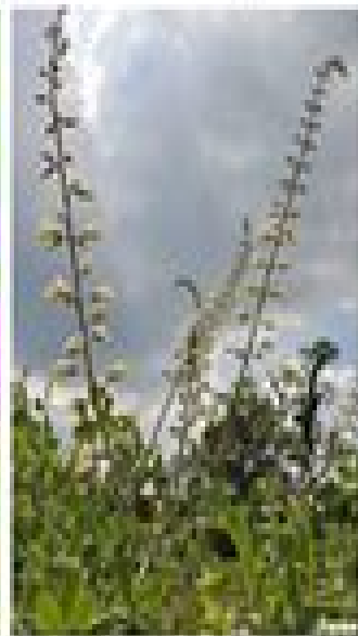
White Wild Indigo Baptisia alba ☼☼ June-July (18 in.)