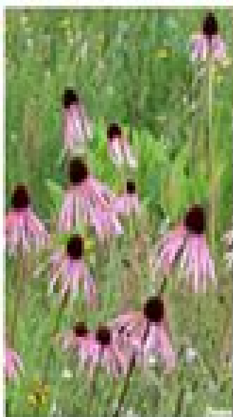
Pale Coneflower Echinacea pallida