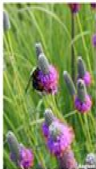
Purple Prairie Clover Dalea purpurea