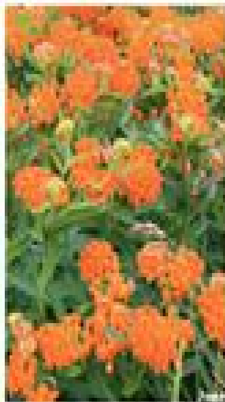
Butterfly Weed Asclepias tuberosa ☼☼ June-August (12 in.)