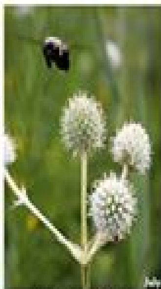
Rattlesnake Master Eryngium yuccifolium