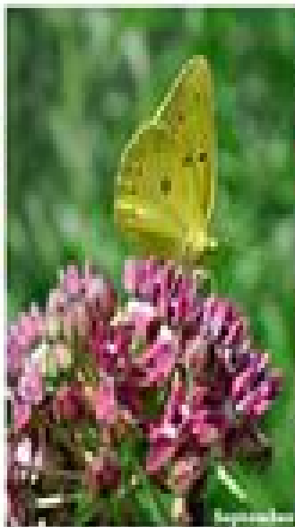
Swaroop Milkweed Asclepias incarnata ☼☼ June-August (18 in.)