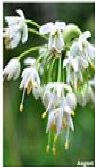
Nodding Wild Onion Allium cernuum ☼☼ July-August (18 in.)