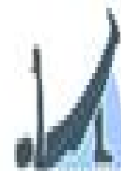
Bridge with Leg Extension