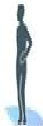
Lower Quarter Rotation