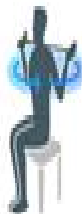
Seated Trunk Rotation