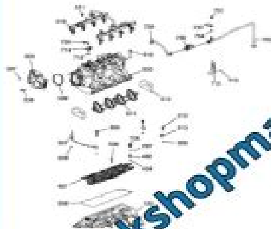
Fig. 4: Engine Assembly Components Courtesy of GENERAL MOTORS CORP.