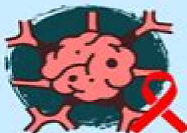
Certains cancers, dont les cancers du sein, de la prostate, du rein & du colon