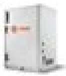
Model 4000000 5.0 to 6.0 ton