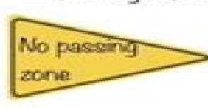
(h) No passing zone