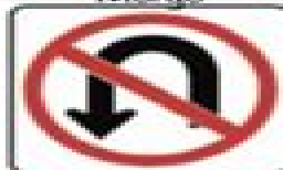
(r) No U-Turn