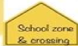
(e) School zone & crossing