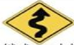
(b) Winding road ahead