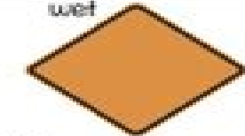
(p) Slow moving vehicle