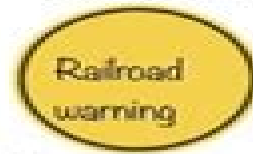
(g) Railroad warning