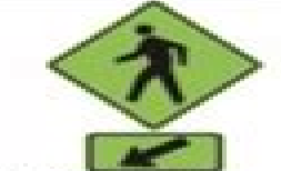
(o) Pedestrian crossing