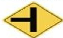
(u) Side road