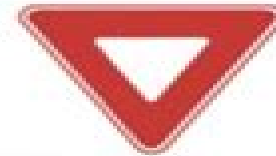
(d) Yield right of way