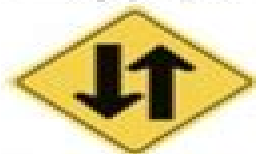
(v) Two way traffic