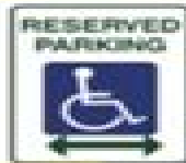
(i) Reserved parking