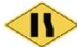
(w) Reduction in lanes