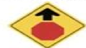
(x) Stop sign ahead