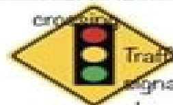
(s) Traffic signal ahead