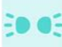
Lamps & Reflectors