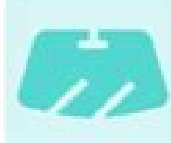
Windshields & Windows