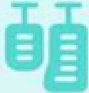
Accelerator Linkage & Brakes