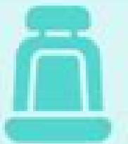
Seats and Seatbelts