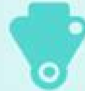
Neutral Safety Switch