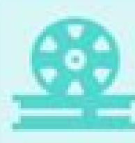
Wheel Mounts & Rims