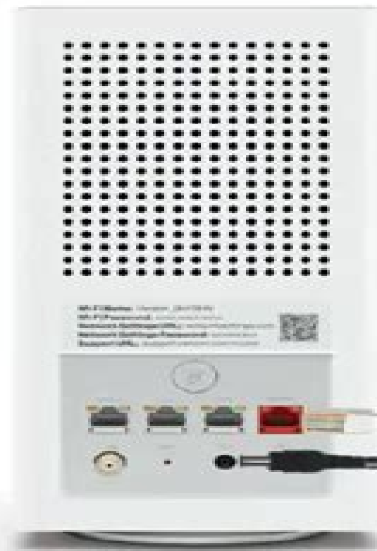
Verizon Router back