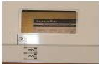
For horns drill holes 2mm