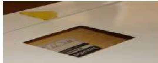
Glue with 5-min Epoxy