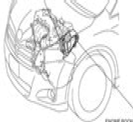
ENGINE ROOM RELAY BLOCK AND JUNCTION BLOCK ASSEMBLY