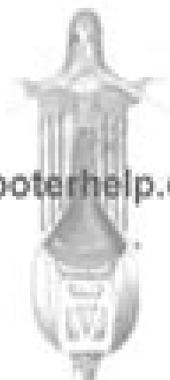
Fig. 11 - Cables harness