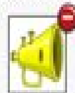
Trumpet Of Blasting