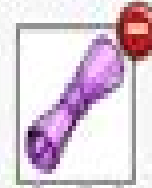
Scroll of Ultraneva