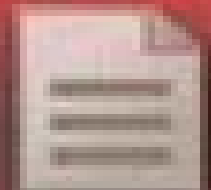
Photo and Video