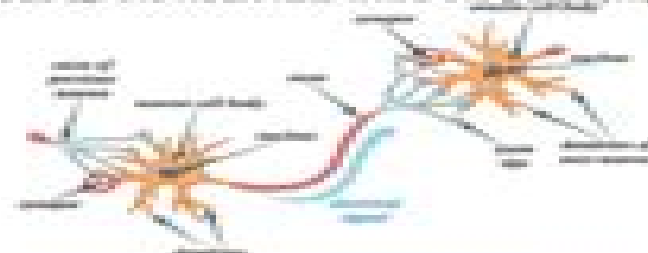
Figure 1.10: A neuron. (credit: "OpenStax")

The PNS is broken down into the somatic and autonomic nervous systems, and the autonomic is further broken down into the sympathetic and parasympathetic nervous systems. Diagram A summarizes the relationship between these systems. The somatic NS is the voluntary system that can be controlled consciously, such as movement of muscles. The autonomic NS is the involuntary system and controls unconscious impulses such as the heartbeat. The sympathetic and parasympathetic systems work opposite of one another. For example, the sympathetic system speeds up the heart rate while the parasympathetic system slows down the heart rate.